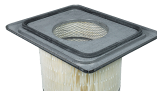
Farr Gold Series Flange