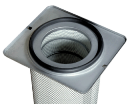
Farr Flange w/Tabs

Each flanged dust cartridge filter from AJR Filtration is engineered to provide a precise and secure fit for specific manufacturers' brands and equipment styles. Our extensive selection ensures you get the ideal replacement filter designed for seamless integration and optimal performance in your dust collection system.